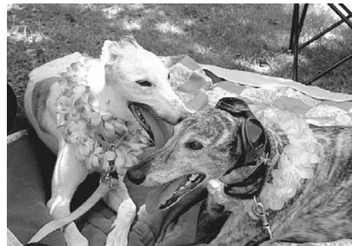
Enjoying the Annual Regap Picnic

WHERE DO DONATIONS GO? All donations help more greyhounds find homes. REGAP is responsible for all veterinary care (spay & neuter & any ailments, including broken legs) from the track to a home, at an average of $500 a dog. But our adoption fee is only about half of that total cost to keep adoption affordable and possible. Every dollar counts toward helping save a life of a racing greyhound and ending this blood sport.