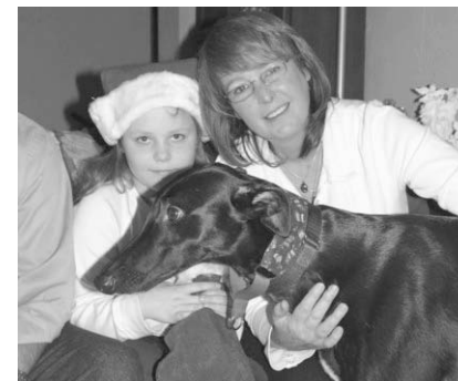
Another Regap rescued greyhound finds a forever-home. A "greyt" present!