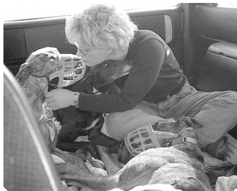
A REGAP Rescuer checks the tags of a newly rescued greyhound and two others rest nearby as they are all transported to safety!

WHAT MAKES REGAP UNIQUE? YOU DON'T HAVE TO HAVE A GREYHOUND TO HELP GREYHOUNDS! REGAP is made up of energetic and passionate people who make greyhound rescue possible. Join our volunteer "Teams" including Rescue, Adoption Agents & Application Reviewers, Fostering, Events and Fundraising, Follow up phone calls to foster homes and much more. Any time you can give, helps save a life.